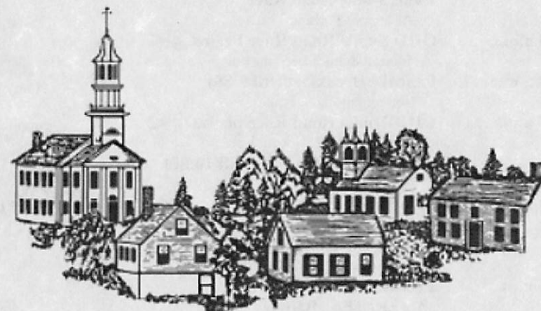
Carlisle Center before 1868

"Here is a place; right over the hill Runs the path I took; You can see the gap in the old wall still, And the stepping-stones in the shallow brook"